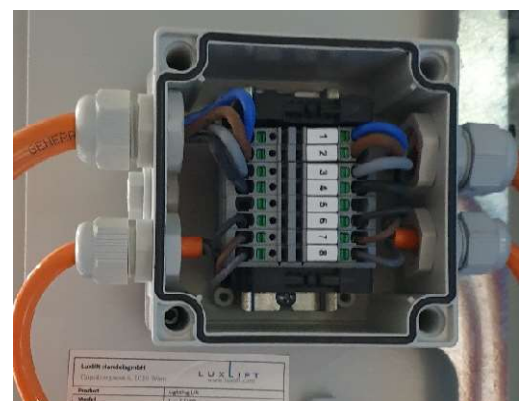
Easy electrical wiring