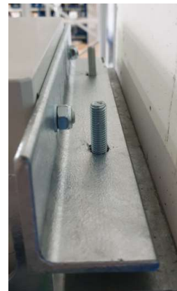
Detail upper mounting bracket