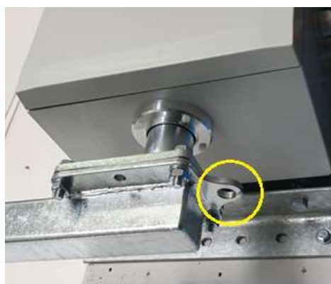
Earth connection via M16 screw