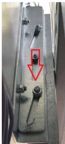
Angle compensation on the lower mounting bracket